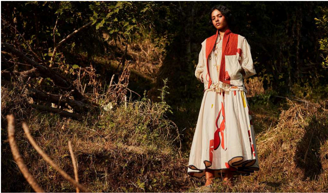
NATURE'S CANVAS CO ORD SET