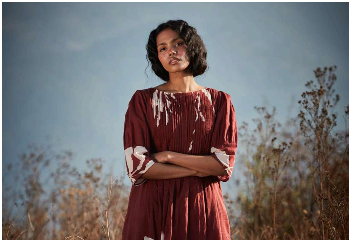
BRICK FLORAL CO ORD SET