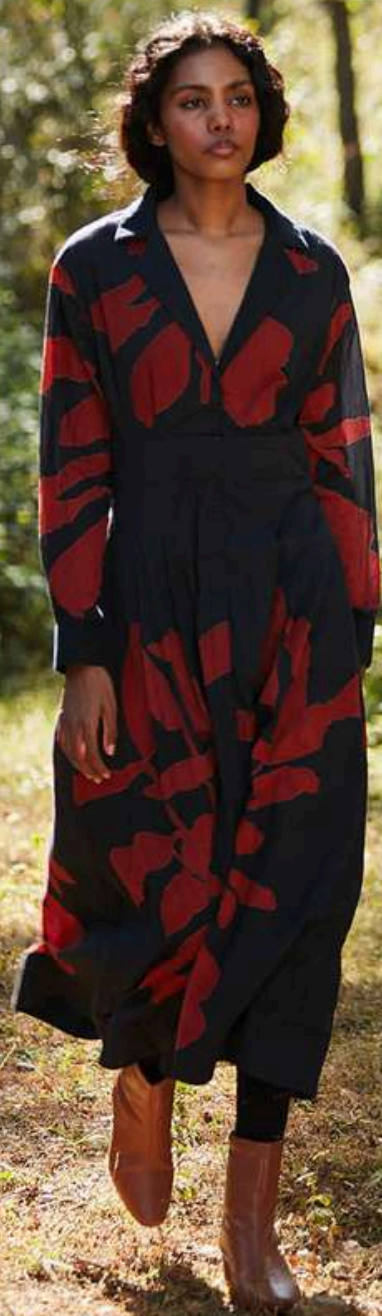
BLACK WOODS DRESS