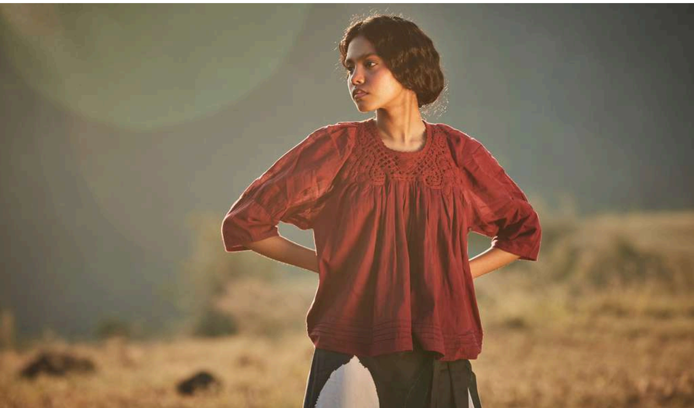
CHERRY BLOOM TOP