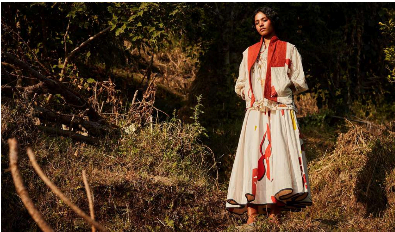
NATURE'S CANVAS CO ORD SET