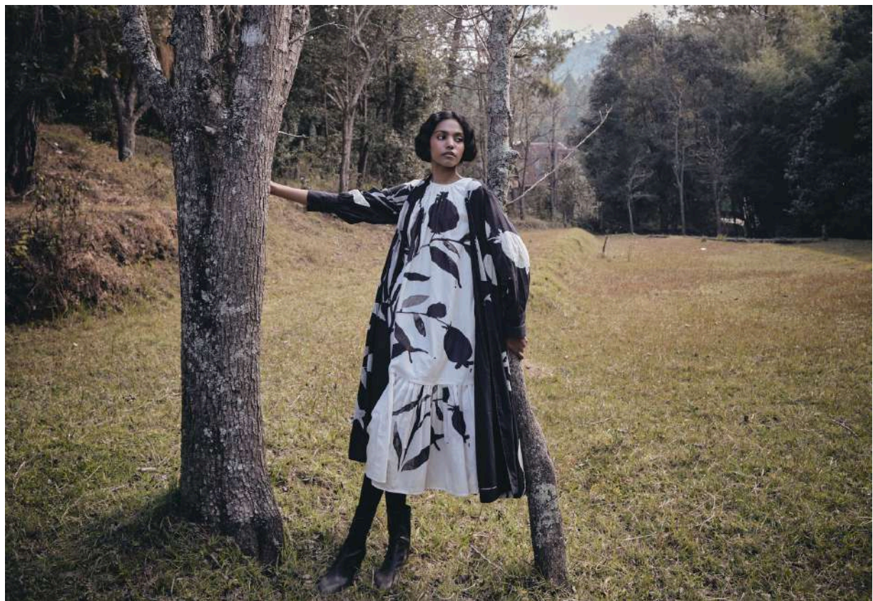
WILD IMPRESSION CO ORD SET