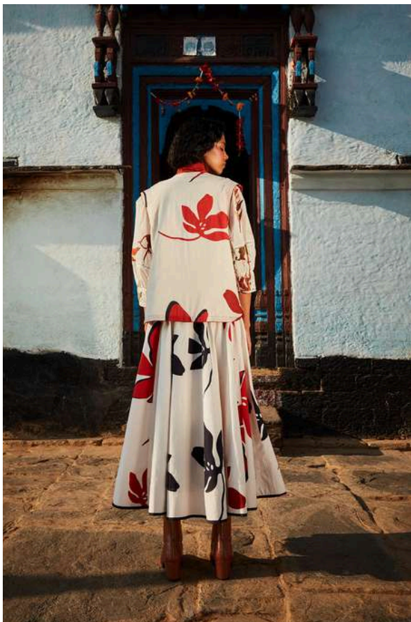
NATURE'S CANVAS SKIRT