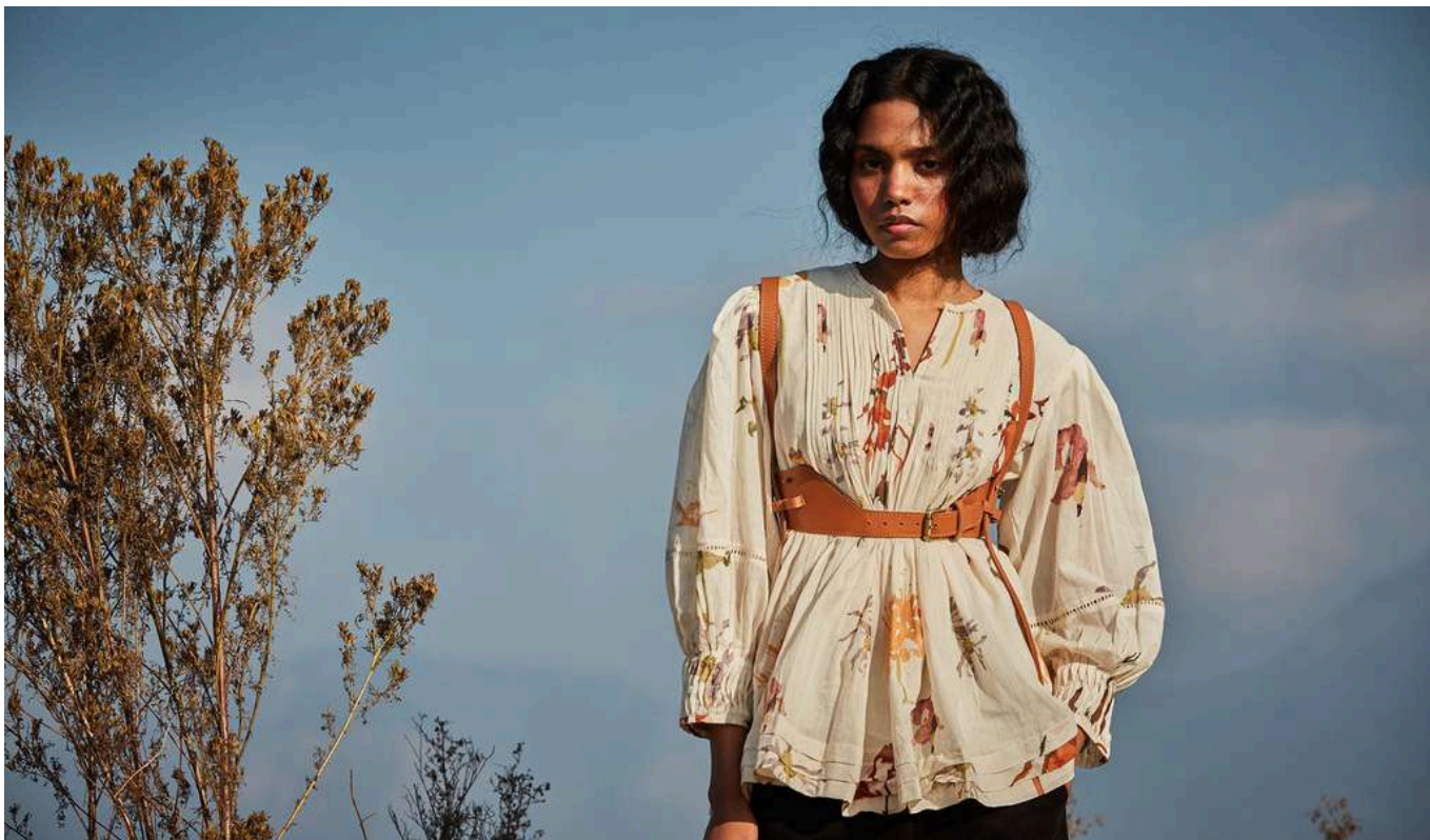
FLORALS IN SNOW TOP