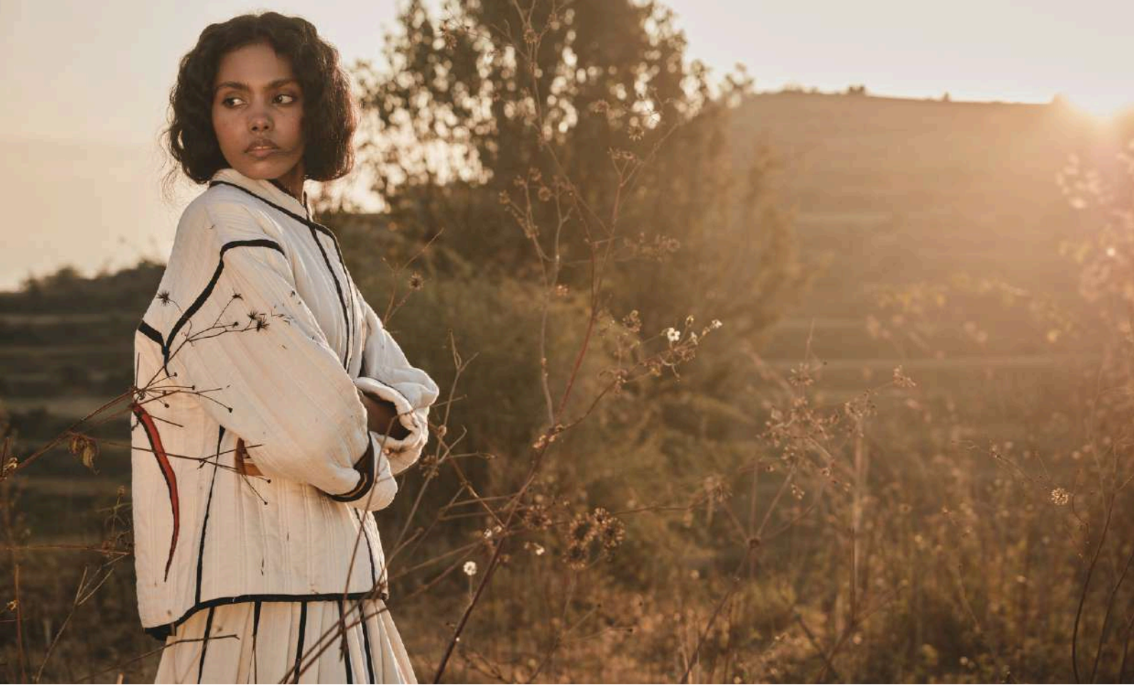
SERENADE CO ORD SET