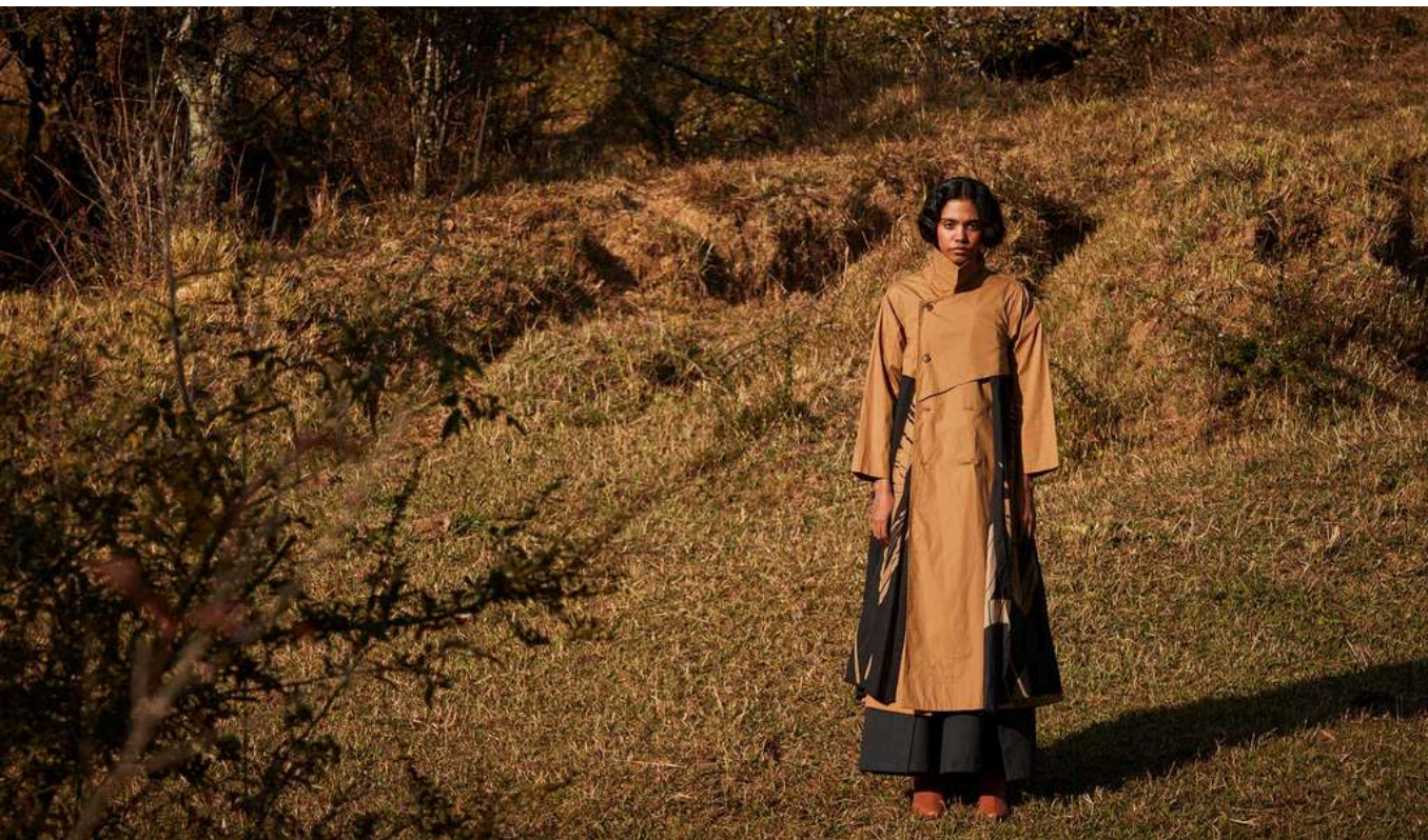
FOGSTONE TRENCH COAT