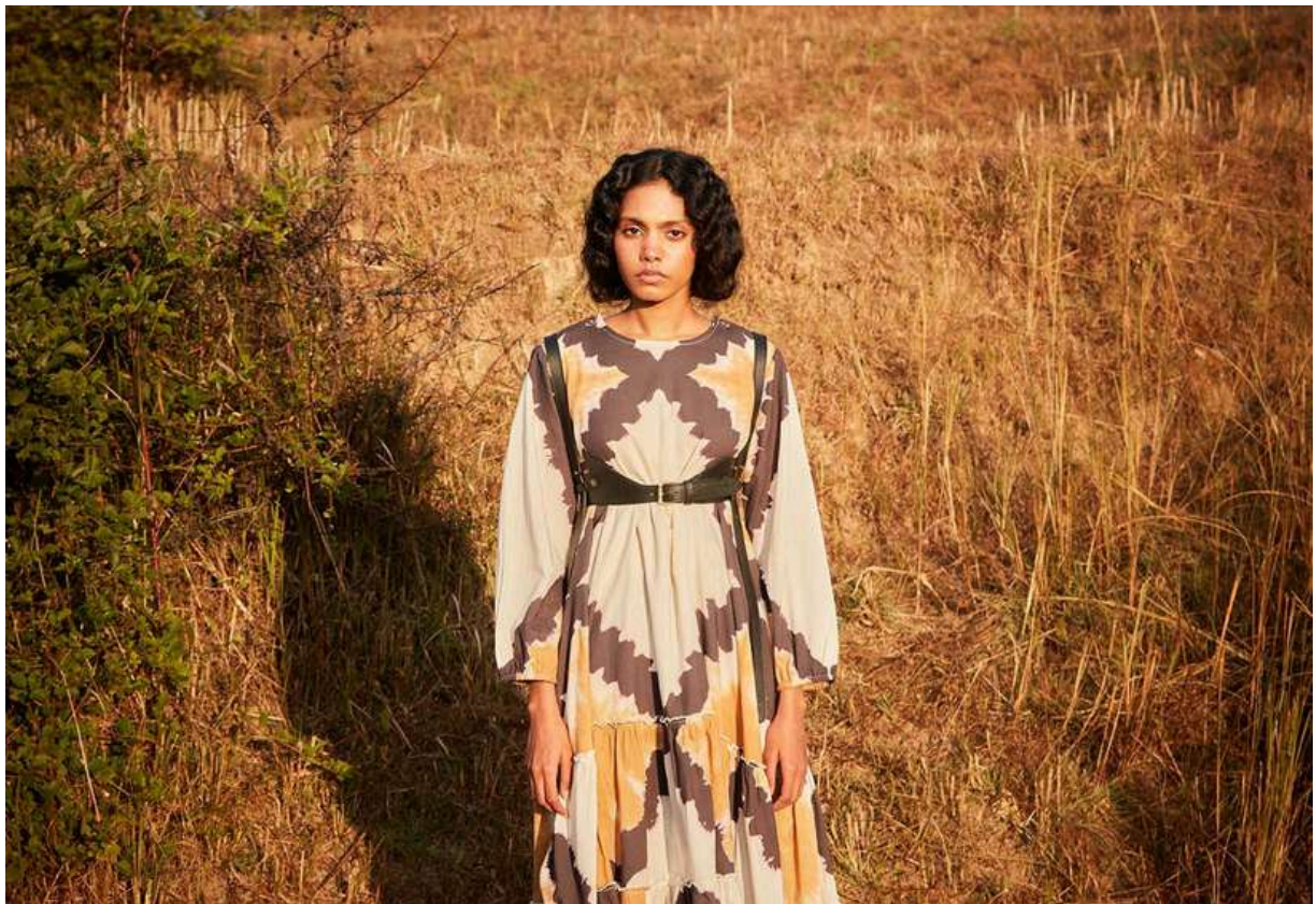
DUNETIME SHIBORI DRESS