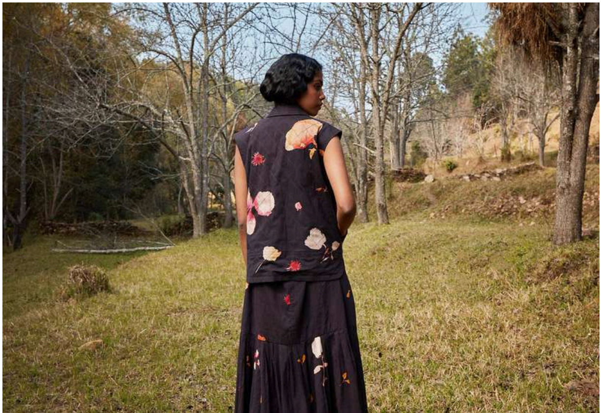
ABSTRACT BOUQUET CO ORD SET