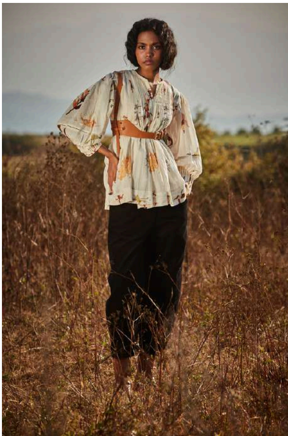
CHARCOAL CORDUROY PANTS

Standing at the edge of the world, draped in fabric that feels as timeless as the peaks themselves, where clouds weave stories into the folds.