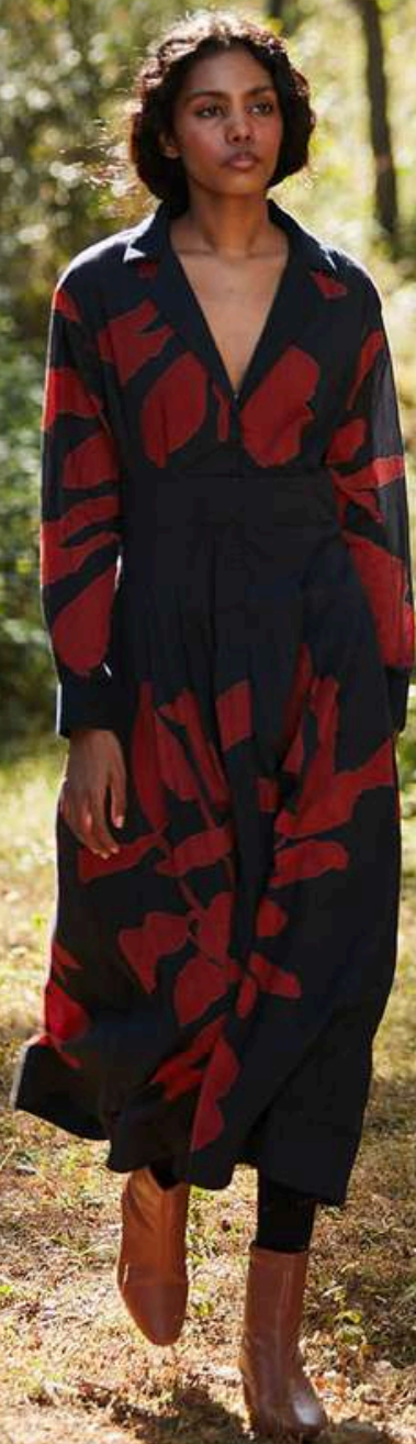
BLACK WOODS DRESS