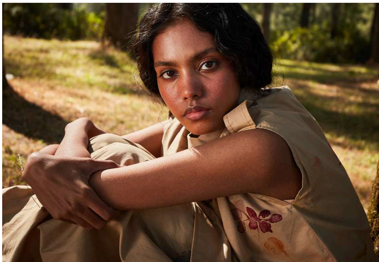
SAND STONE CO ORD SET