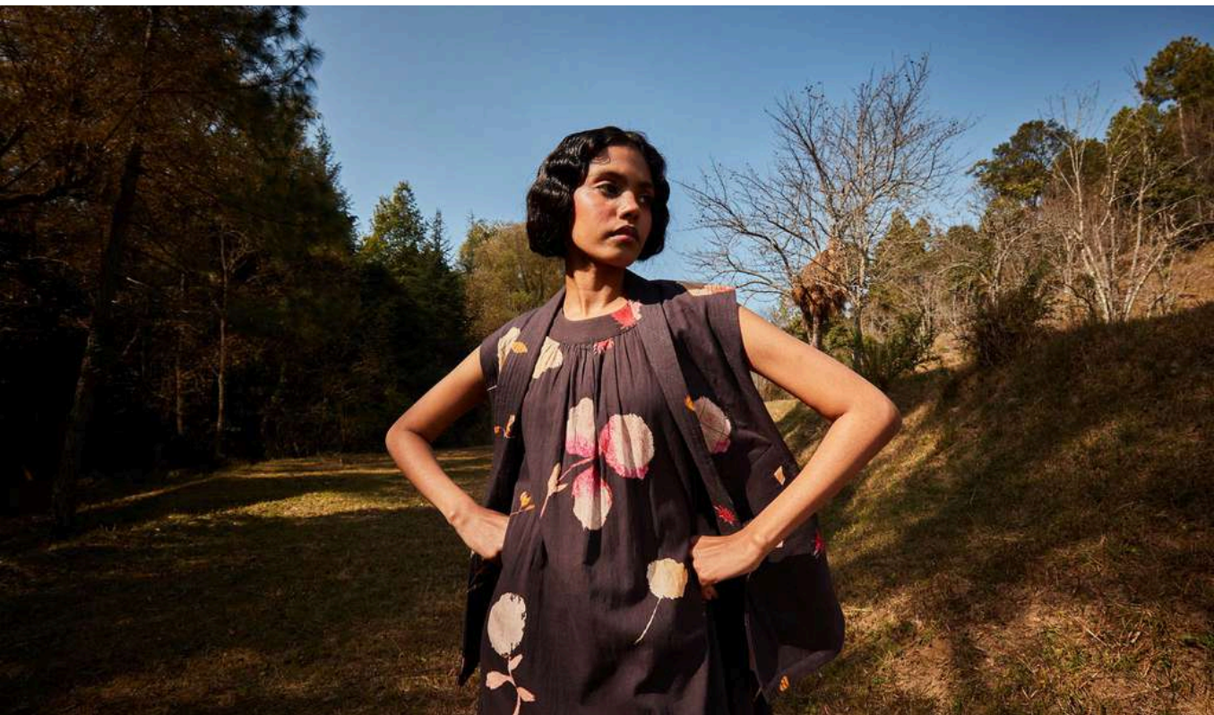
ABSTRACT BOUQUET CO ORD SET