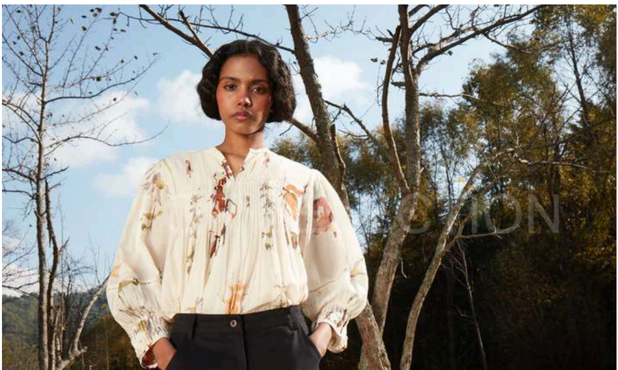
FLORALS IN SNOW TOP