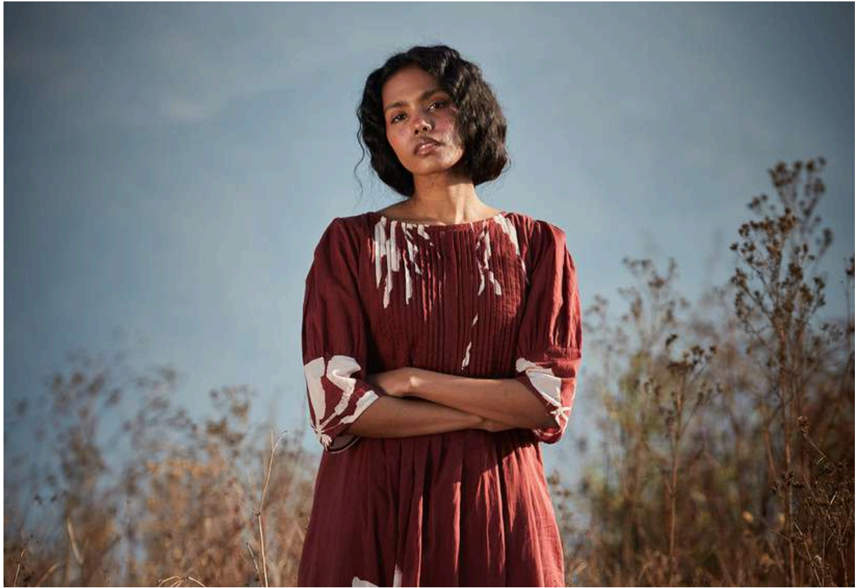
BRICK FLORAL CO ORD SET